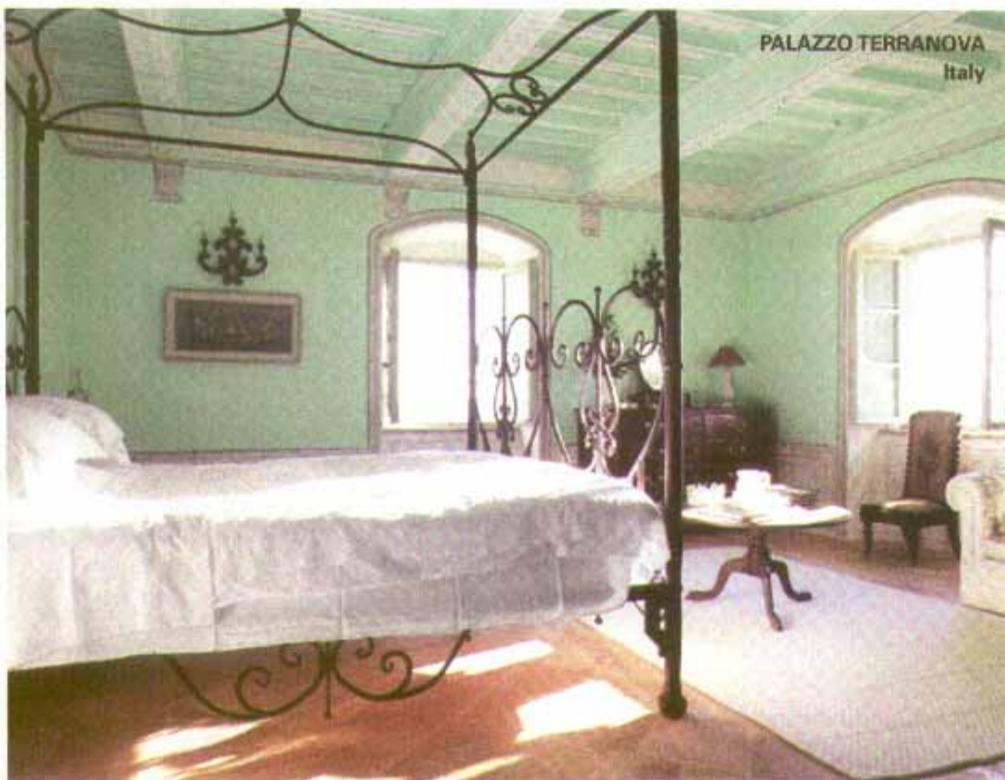
PALAZZO TERRANOVA Italy